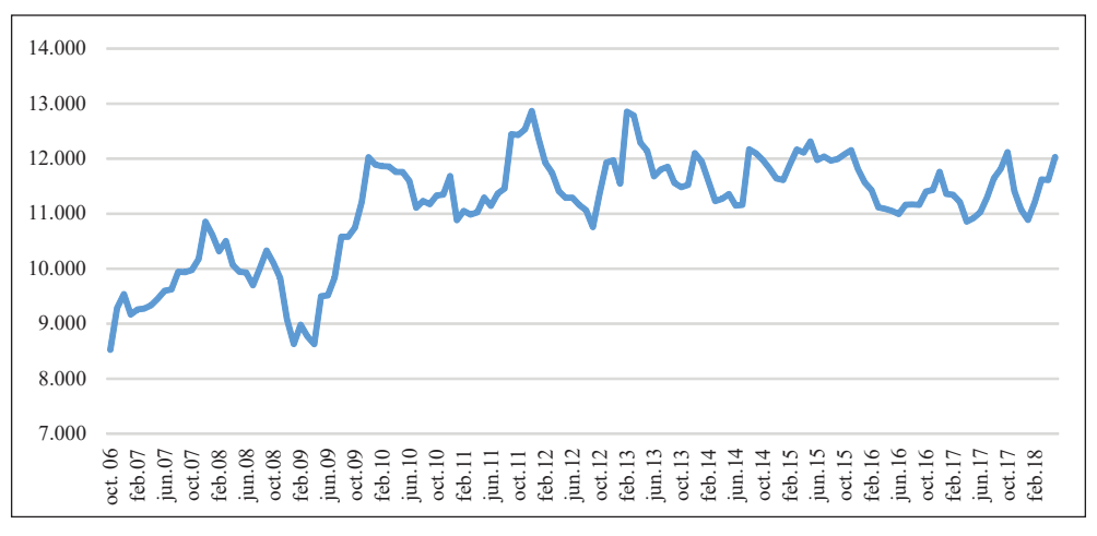
Graph 3: Evolution of the exchange rate reserves in the Republic of Serbia for the period from October 2006 to May 2018 (In million EUR)