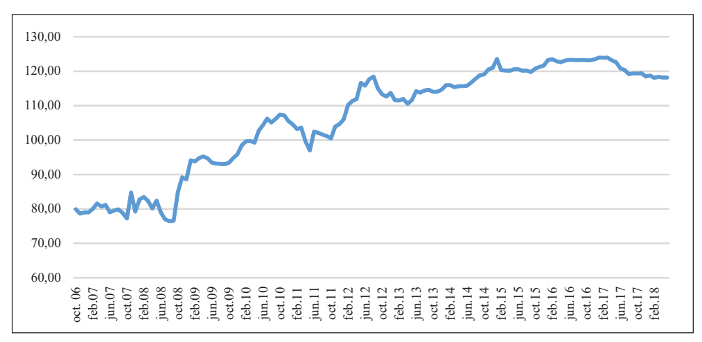
Graph 2: Evolution of the nominal exchange rate of the Serbian dinar against the euro in the Republic of Serbia for the period from October 2006 to May 2018